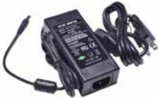
STVOFL63D LED Pre-Wired Driver - Input: 100 - 240V - Output: 60 Watts/24/2.5A DC - Dimension: 4.63"W x 2"D x 1.25"H