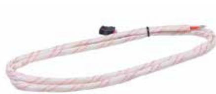
STDC36GPPF Hardwire Power Feed Length: 36"