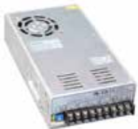
STVO32024D LED Three Channel Driver - Input: 85-265VAC (120-370VDC) - Output: 3 x 100 Watts/24VDC - Dimension: 8.5"W x 4.5"D x 2"H