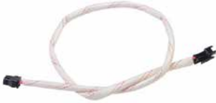
STDC18GPJ Panel Joiner Length: 18"