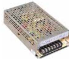
STVO15024D LED Two Channel Driver - Input: 110V-120V - Output: 150 Watts/24VDC - Dimension: 6.63"W x 2.63"D x 2.25"H