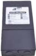
STDC10024D LED Dimmable Driver - Input: 110V - Output: 100 Watts/24VDC - Dimension: 6.63"W x 2.63"D x 2.25"H