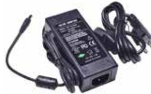
STVOFL100D LED Pre-Wired Driver - Input: 100 - 240V - Output: 100 Watts/24/4A DC - Dimension: 5.5"W x 2.31"D x 1.25"H