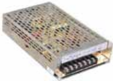
STVO10024D LED One Channel Driver - Input: 100-240VAC - Output: 100 Watts/24VDC - Dimension: 6.25"W x 3.88"D x 1.5"H