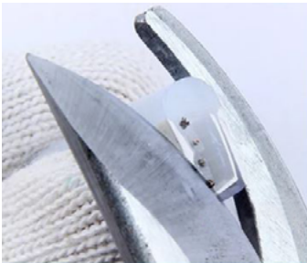
Step 1. Cut RGB FLEX NEON at its cut marking point.