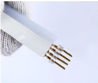
Step 3. Insert the 4-Pin connector into the RGB FLEX Neon strip.