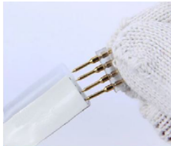
Step 2. Align 4-Pin Power to Strip Connector with the LED RGB Neon strip's connector points.