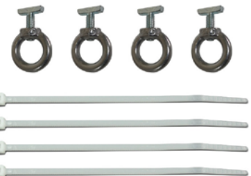
Back-Lit LED Ladder Light Mounting Kit Included